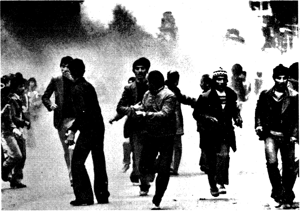
Demonstrators in Tehran flee through city streets when soldiers open fire on the crowds;

According to a report by the Rand Corporation there have been 42 terrorist assaults on diplomatic missions since 1971, with almost half of them having taken place within the past two years.