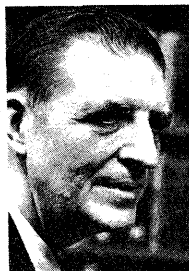
Carl F. Henry